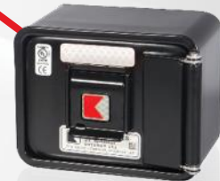
Knox eLock Products