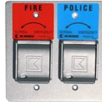
Knox Gate & Key Switches™

Meets the requirement in the school safety standard rule for gated secured areas needing emergency access